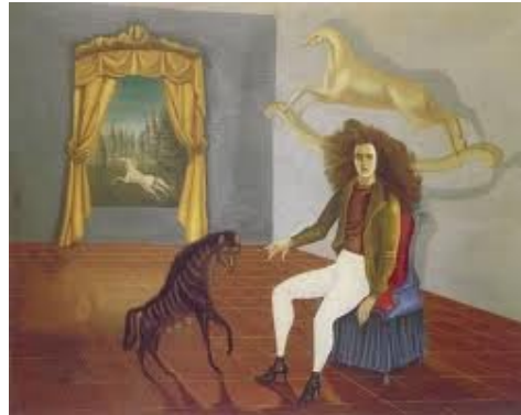
5. Self Portrait 1 , Leonora Carrington, 1938

Interestingly neither Mansour nor the surrealist protégé of Andre Breton, Gisele Prassinis receive any acknowledgement in the 1980's editions of Surrealist poetry and twentieth century French poetry, leaving a considerable gap across the 1920's and 1930's where female surrealist writers are concerned. Even in the twenty first century much of their work remains out of print. (Suleiman,1990 :212). This is a poignant indictment to the extent to which women were simply not recognised by the surrealist movement until much later in the twentieth century. And a significant argument in the ambiguous discourse pertaining to